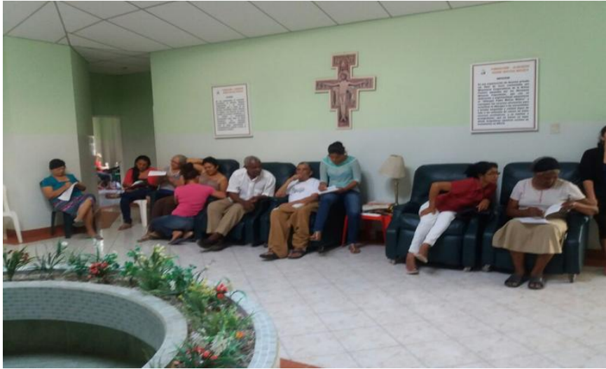
Figure 1. Moments of realization of the resilience workshops

Saavedra [10] were applied. Figure 1 shows one of the moments during the realization of the resilience workshops with the presence of the sick and their relatives.